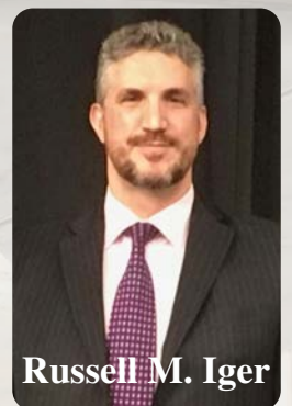
Russell M. Iger

Invite Others to Join our Newsletter By Clicking Here